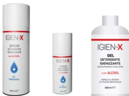
SPRAY 400 ml SPRAY 100 ml GEL 500 ml