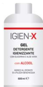
SPRAY 400 ml SPRAY 100 ml GEL 500 ml