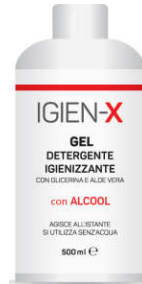
SPRAY 400 ml SPRAY 100 ml GEL 500 ml